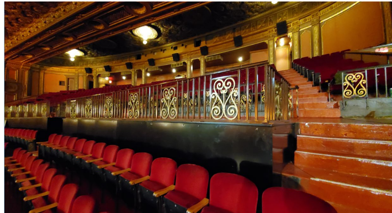
Sightline specially designed picket railing featuring custom scrollwork, filigree and medallions.