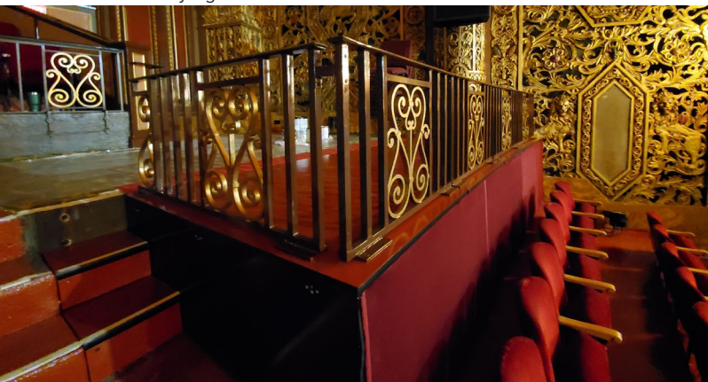
ADA compliant platform infills created accessible systems for wheelchair users.