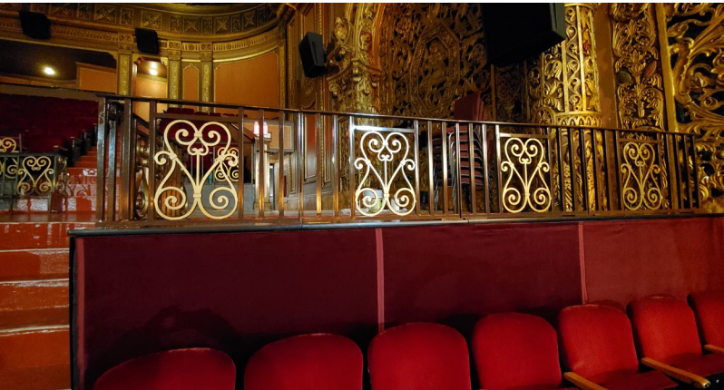
Sightline Commercial Solutions leveraged its custom capabilities to seamlessly integrate new railing applications with the building's architecturally significant structure.

Scope: Manhattan's United Palace of Spiritual Arts is a transformational venue where spirituality, art, entertainment and community unite. Since opening in 1930, the building has undergone numerous reinventions, from a movie theater and vaudeville hall to a non-denominational church and performing arts center. Today, the venue hosts hundreds of events each year, including spiritual gatherings and movie screenings as well as live performances by some of the world's biggest names in music, dance and theater. It has also been featured in countless films due to its well-preserved historic ambiance. Maintaining the integrity of the venue was a top priority for the building's latest remodel. With that in mind, Sightline Commercial Solutions leveraged its custom capabilities to seamlessly integrate new railing and staging applications with the building's architecturally significant structure. By combining ADA compliant platform infills with specially designed picket railing featuring custom scrollwork, filigree and medallions, Sightline Commercial Solutions created accessible systems for wheelchair users that updated the space while preserving its original aesthetics.