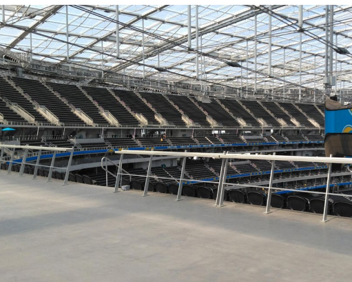
Custom drink rail allows spectators to enjoy a beverage without missing any action.