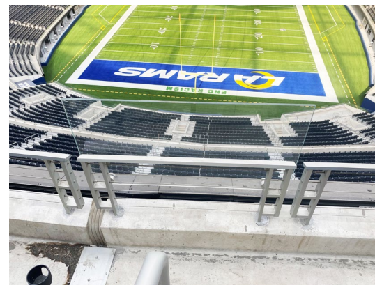
Custom cable railing at front of fan seating areas with Track Rail used on top.

We elevate places where experiences happen by providing innovative engineering, fabrication, and installation solutions to the most complex challenges. Discover our unconventional approach.