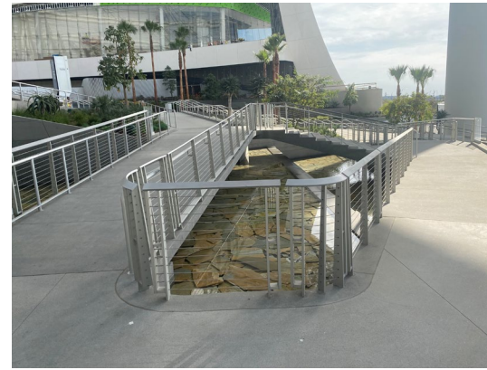
Tensiline™ Cable Railing lines exterior walkways outside SoFi Stadium.