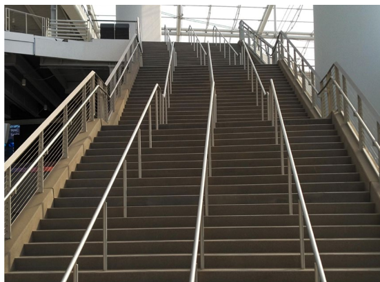
9,000 linear feet of LED Railing located in the concourse and fan seating area.