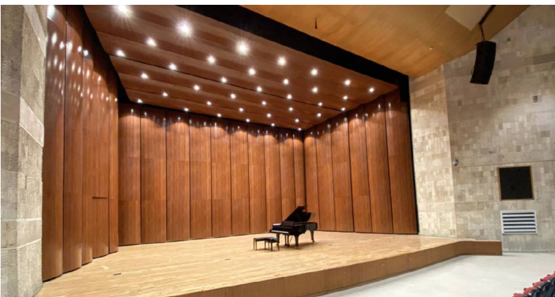
Featuring elegant mobile towers and ceiling panels that collaborate to form a resounding performance space.