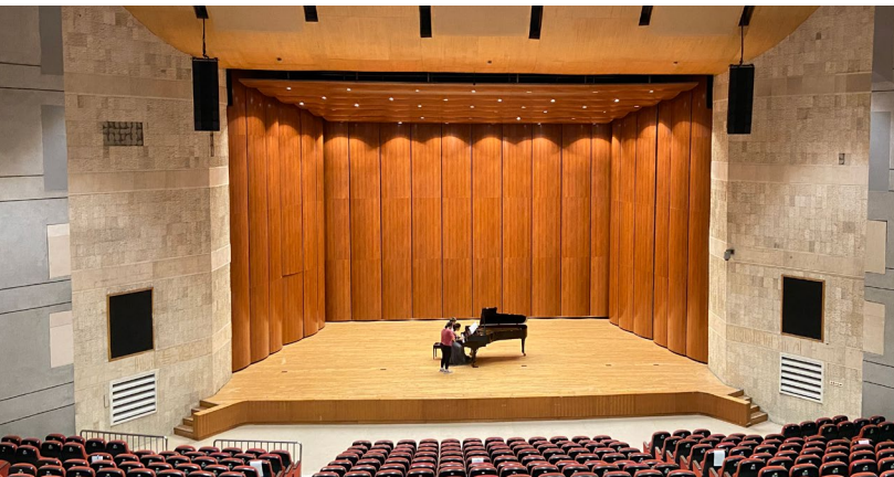
The Bravado is the epitome of acoustical shells as it is highly customizable.