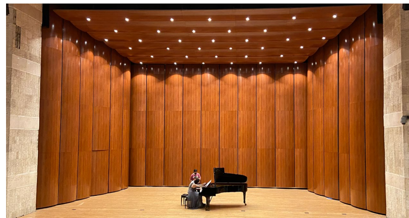
The venue holds more than 920 seats and hosts numerous theatrical and musical performances throughout the year and requires a durable and amplified acoustic setting for each performance.

We elevate places where experiences happen by providing innovative engineering, fabrication, and installation solutions to the most complex challenges . Discover our unconventional approach.