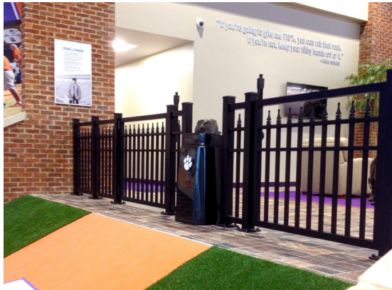
Custom black painted aluminum vertical square picket style guardrail with custom cast picket spear top.