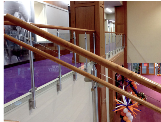
Sleek fascia mounted Monaco glass railing with wood top cap overlooks main lobby.