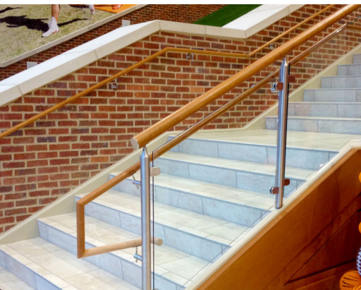
Top mounted Monaco railing with wood top cap and handrail utilized the D-shaped clamp to secure glass infill.