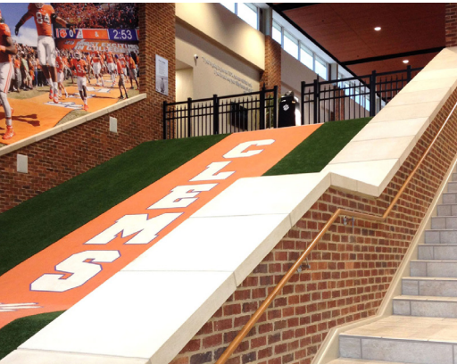
Custom aluminum guardrail tops a replica of "The Hill" in the main entrance.