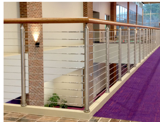
Casino cable railing with round stainless steel posts, and wood top cap is featured throughout the facility.

We elevate places where experiences happen by providing innovative engineering, fabrication, and installation solutions to the most complex challenges. Discover our unconventional approach.