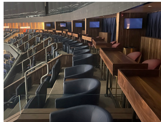
Stainless steel GripRail™ aisle railing used throughout the arena.

We elevate places where experiences happen by providing innovative engineering, fabrication, and installation solutions to the most complex challenges. Discover our unconventional approach.