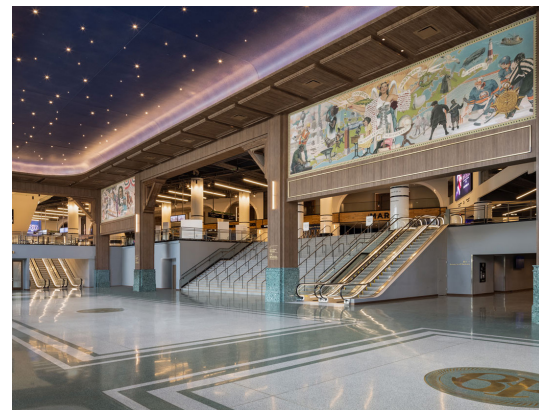
Railing allows fans to easily navigate all levels of the arena.