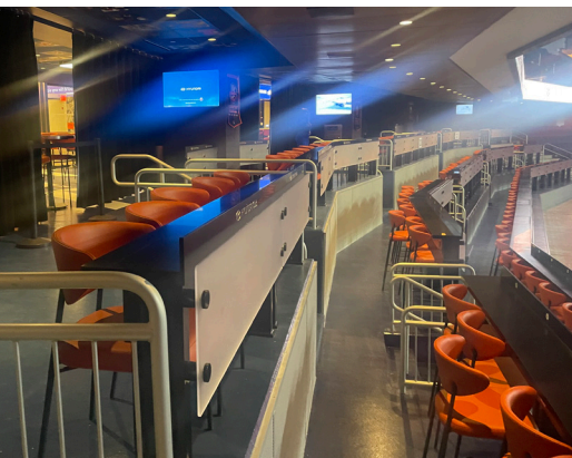
Fans can sit back and enjoy the game with unobstructed views from every seat.