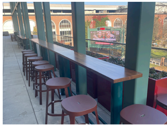
Fans can fuel up and enjoy the views at the arena.