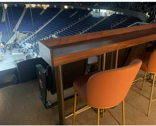
Custom drink rail allows fans to enjoy beverages without missing the action.