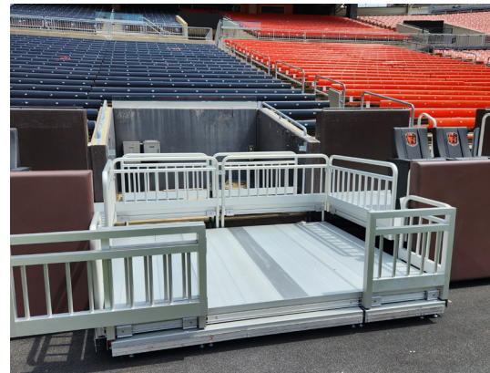
Camera platform areas with attachments for supporting field pads.

We elevate places where experiences happen by providing innovative engineering, fabrication, and installation solutions to the most complex challenges. Discover our unconventional approach.