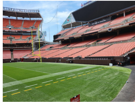
Sightline Commercial Solutions used 3-D laser scanning technology to capture precise measurements of the sidelines and end zone areas.