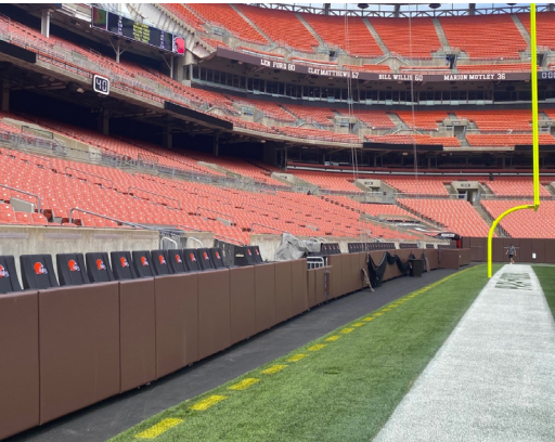
Endzone seating sections allow avid fans to get even closer to the action.

Scope: Providing a close and captivating experience for spectators, sideline and end-zone seating sections have become increasingly popular due to their proximity to players and the action on the field. A prime example of this trend can be found at Cleveland Browns Stadium, where Sightline Commercial Solutions worked in tandem with seating provider DreamSeat to bring a unique gameday viewing experience to downtown Cleveland’s North Coast Harbor District. Using 3-D laser scanning technology, our team captured thorough and precise measurements of the sidelines and end zones and built the foundations for custom VIP seating systems using weather-resistant aluminum SC97 platforms and clear anodized IBC guardrail. Our team also installed camera platform areas with attachments for supporting field pads and mounts for securing DreamSeat’s chairs. Additionally, we fabricated field gates to match the stadium’s existing style. The successful execution of this project has led to additional work within the stadium and strengthened relationships with both the Browns and DreamSeat.