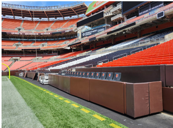
All railing and platforms were designed to match the stadium’s existing aesthetic.