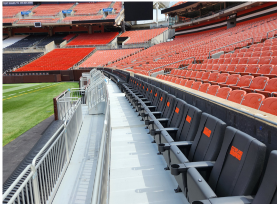
Weather-resistant aluminum SC97 platforms through the VIP seating area.