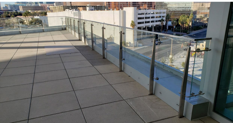
The third-floor outdoor terrace safely allows up to 20,000 attendees to enjoy views of the Las Vegas Strip, thanks to our glass guardrail.