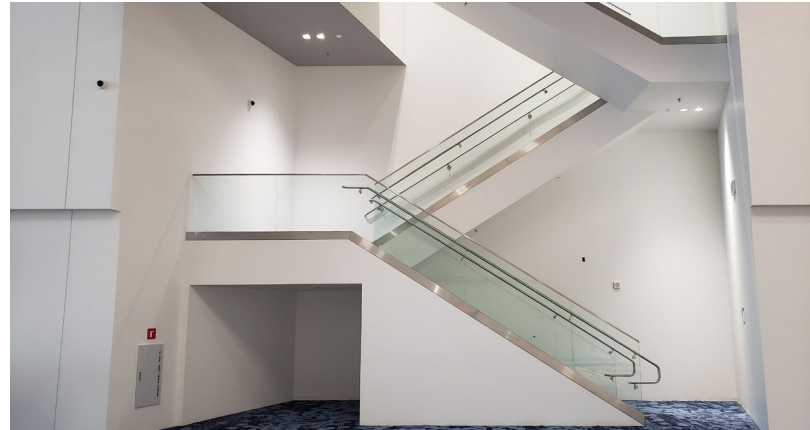
Custom engineered Sightline Commercial Solutions railings are used in three switchback stair locations.