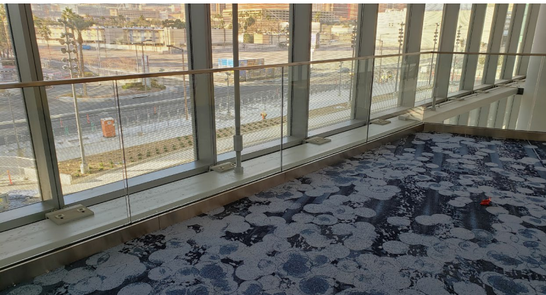
Glass Guardrail is shoe mounted and post mounted throughout the convention center.

Scope: One of the busiest meeting facilities in the world, the Las Vegas Convention Center debuted a $1 billion, 1.4 million square foot West Hall expansion in early 2021. The new facility, which connects the Las Vegas Strip to the convention center's South Hall, boasts a contemporary design and an abundance of natural light. The space also features more than 4,100 linear feet of Sightline Commercial Solutions' customized railing. Using 3-D site scanning, our team designed railing systems for use on two levels of the grand lobby overlook, the venue's monumental stairs and adjacent overlooks, multiple sets of switchback stairs and along the skyway bridge. Due to the construction of the stairs, the Sightline Commercial Solutions team also custom engineered an alternate "false" stringer to securely accommodate the shoe attachment for the glass guardrail. Glass guardrail is also featured along the third-level outdoor terrace, which can accommodate 20,000 attendees and offers stunning views of the Las Vegas Strip.