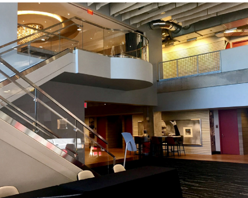
A total of 322 square feet of tempered low iron glass was used for the staircase and overlook railing.