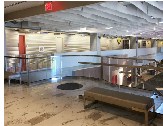
The sleek design of the Track Rail system blends seamlessly with the interior of the lounge.