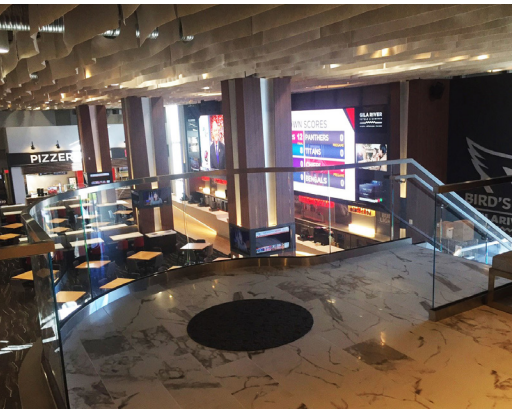
Curving railing is a challenging endeavor, requiring careful work and precise measurement.

The Arizona Cardinals envisioned a more sophisticated Club Level at the State Farm Arena, formerly known as the University of Phoenix Stadium. With the recent opening of the 50-Yard Lounge, they scored a win by effectively combining luxury, entertainment, and of course — football. Completed in 2017, the renovated lounge features extensive upgrades, including an HD/ LED video wall, illuminated bars and upgraded finishes. Sightline Commercial Solutions’ Track Rail was central to creating an inviting experience for Cardinals fans. We used 322 square feet of tempered low iron glass for staircases and overlook railing areas. The sleek design of the Track Rail system blends seamlessly with the interior of the lounge area.