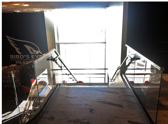
A 2x2” custom square top cap made from 16 gauge stainless steel wraps around the glass railing on the stairs and the overlook.