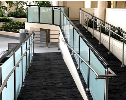
ADA ramp within indoor pool area features Aspen glass railing with 1/2" laminated glass.