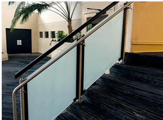
Vertical black anodized aluminum channels, which secured glass in place, were fastened to round stainless steel posts with Rivnuts.