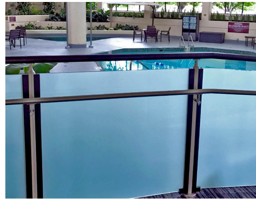
Glass infill secured by vertical black anodized aluminum channels running the height of the post.