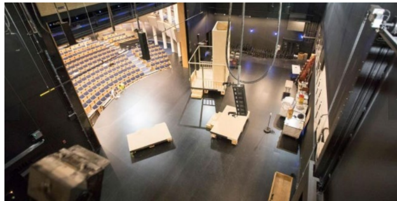
Orchestra pit filler adds flexibility for increased performance space to the stage.

We elevate places where experiences happen by providing innovative engineering, fabrication, and installation solutions to the most complex challenges . Discover our unconventional approach.