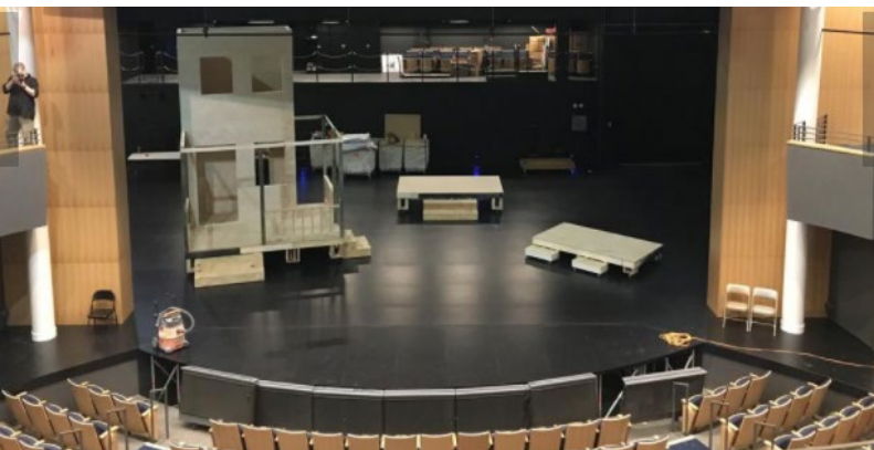
Platforms and supports hidden beneath the pit creates a seamless look while allowing faster and easier changeovers between scenes