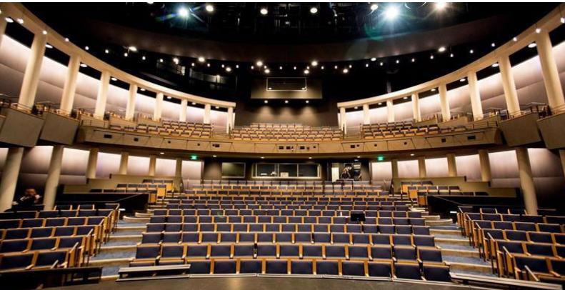
The new 35,000 square-foot facility more than doubled the seating capacity of its previous theater.

For more than 50 years, the After Dinner (A.D.) Players theater company has been a mainstay of Houston’s performing arts scene. In 2017, the company built a new 35,000-square-foot facility in The Galleria, Houston’s largest shopping center, which more than doubled the seating capacity of its previous theater. To ensure its first production, To Kill a Mockingbird, set the stage for continued success in the years ahead, the facility enlisted Sightline Commercial Solutions to supply an orchestra pit filler, adding flexibility for increased performance space. Designed to look and feel like a permanent stage, the platforms and supports hidden beneath the pit creates a seamless look while allowing faster and easier changeovers between scenes or performances.