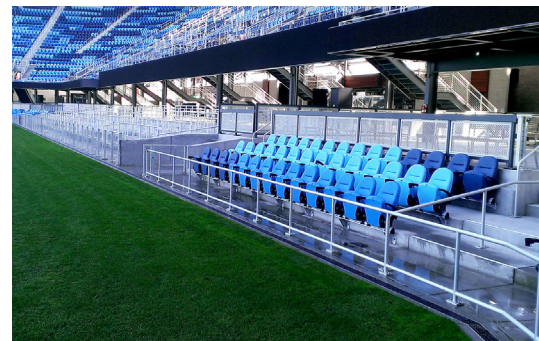
Aluminum guardrail in pitch level suites.

We elevate places where experiences happen by providing innovative engineering, fabrication, and installation solutions to the most complex challenges. Discover our unconventional approach.