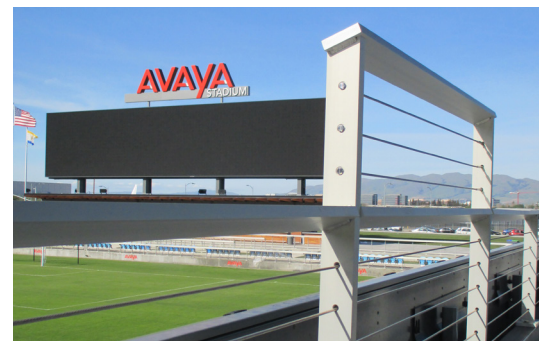
Tensiline™ Cable Railing throughout stadium.