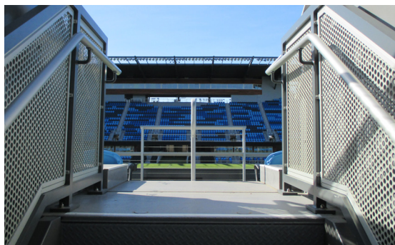
Aluminum frame with painted perforated infill panel.