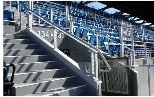
Tensiline Cable Railing at seating entrances.