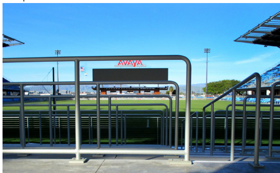
Aluminum Safe Standing™ Rail for supports sections at end zones.