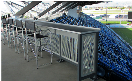
Aluminum frame with painted perforated infill panel and drink rail attachment.