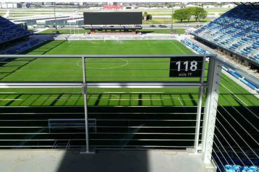
Tensiline Cable Railing with hinged drop down for camera bay areas.