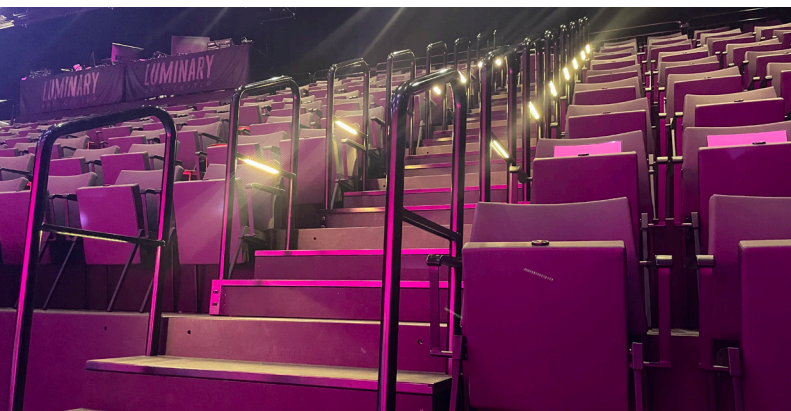
Handrail and stair units integrated with aisle lighting to safely guide guests to and from their seats.