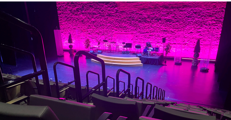
The risers can be configured different arrangements depending on the performance while ensuring an enhanced viewing experience.