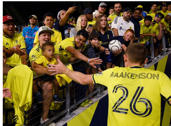
Fans in the stands kept safe by cable rail while supporting their favorite team.