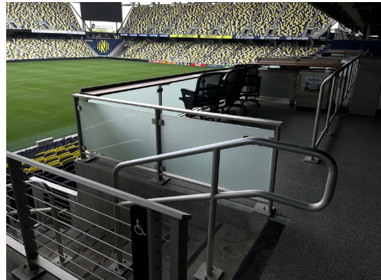
High definition 3D laser scanning was used to assure a perfect fit the first time.