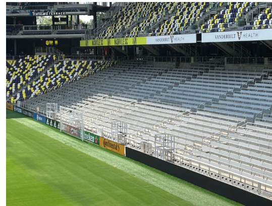
Sightline’s innovative Standing Rail provides a high energy fan supporter section close to the action.

We elevate places where experiences happen by providing innovative engineering, fabrication, and installation solutions to the most complex challenges. Discover our unconventional approach.