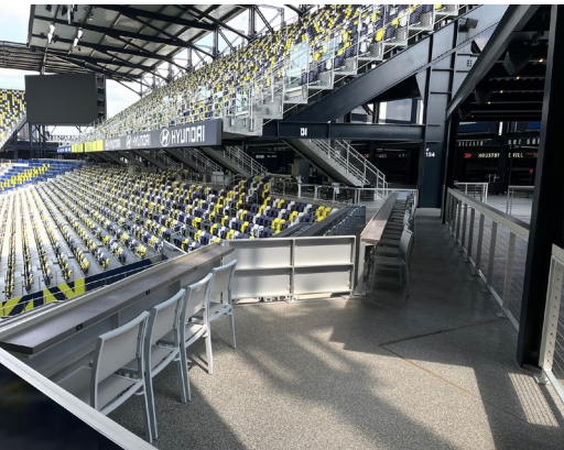
Drink rail offers convenient, “hands-free” support for beverages and belongings.