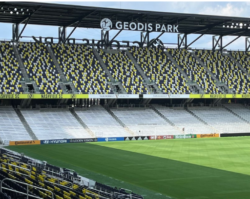
More than 22,000 linear feet of Sightline Commercial Solutions railing, including cable rail, aisle rail and grip rail.

Scope: As the largest soccer-specific stadium in the U.S., GEODIS Park was designed with soccer supporters in mind. The $335M home to Major League Soccer’s Nashville SC features 30,000 seats, a 360-degree canopy, a 65-foot-wide shared concourse and just 150 feet of space separating fans from the field. It also is outfitted with more than 22,000 linear feet of Sightline Commercial Solutions railing, including cable rail, aisle rail and grip rail, adding style and safety throughout the venue. Among the highlights is a dedicated supporter section with 5,000 linear feet of custom engineered Standing Rail. This innovative system features ergonomic lean rail and integrated flip-down bench seats that allow avid fans to comfortably stand or sit while cheering on their favorite team, enhancing the electric match day atmosphere. Anodized aluminum rail and stainless-steel clad glass guardrail can be found within the Southeast and Southwest terraces, while drink rail in key areas offers convenient, “hands-free” support for beverages and belongings. Continuous corners at ADA locations allow for ultimate fan comfort and accessibility. Exceeding standards for longevity and performance, Sightline Commercial Solutions leveraged 3-D laser scanning and tube lasers to engineer all aisle railings, ensuring precision and perfection and elevating the safety and design of this premier sports and entertainment destination.