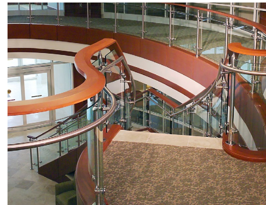
The top cap and stainless handrail take on a serpentine shape.

We elevate places where experiences happen by providing innovative engineering, fabrication, and installation solutions to the most complex challenges. Discover our unconventional approach.