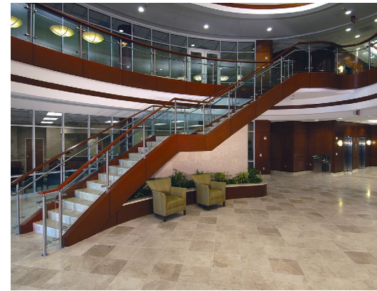
Clear tempered glass was utilized throughout the railing system.