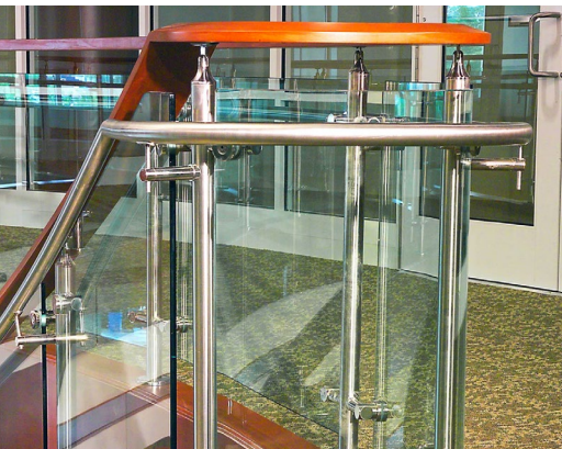
Plexiglass was used in place of glass to accommodate the tight radius.