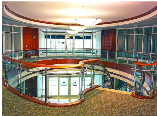
Clear glass infill panels allow for the passage of light within the space.