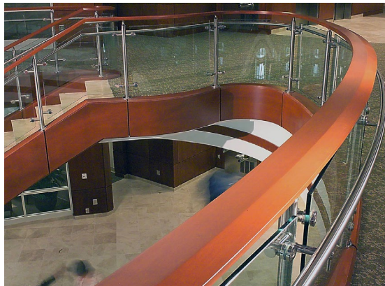
The custom-shaped wood top cap sets this railing system apart.