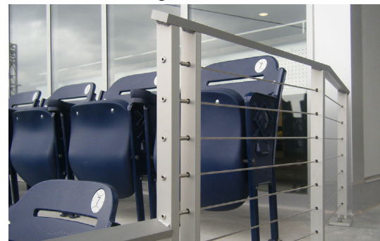
Tensiline cable railing with aluminum frame.

We elevate places where experiences happen by providing innovative engineering, fabrication, and installation solutions to the most complex challenges. Discover our unconventional approach.