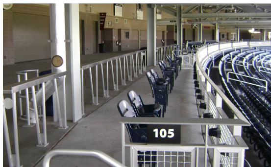
Gridguard intercrimp wire mesh within a U-edge channel border.