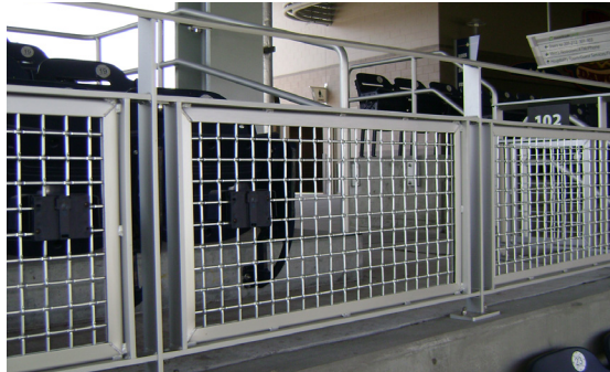
Gridguard mesh railing with anodized aluminum frame.