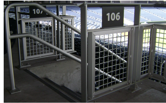
Custom aluminum mesh railing, and aluminum aisle railing.