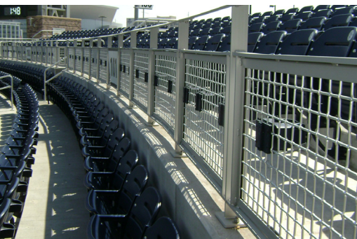
Gridguard intercrimp wire mesh within a U-edge channel border.