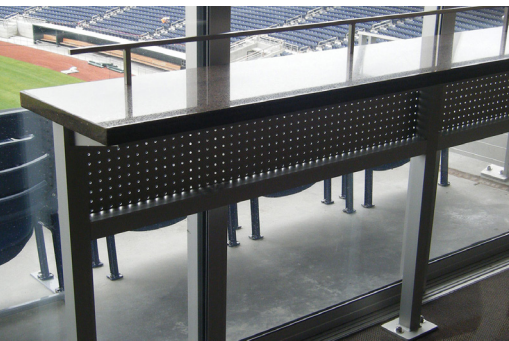
Custom post supported drink rail within suite areas and throughout the ballpark.