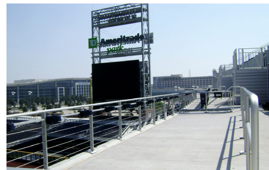
Tensiline cable railing with aluminum frame.