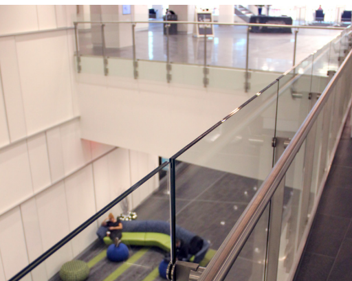
Stainless grip rail provides system rigidity, eliminating the need for a top cap.