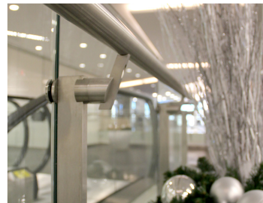
Distinctive handrail standoff mounts are inherent to the Dot railing system.

We elevate places where experiences happen by providing innovative engineering, fabrication, and installation solutions to the most complex challenges . Discover our unconventional approach.