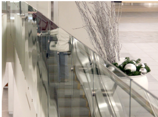
The exclusion of a top cap creates a cleanline profile.