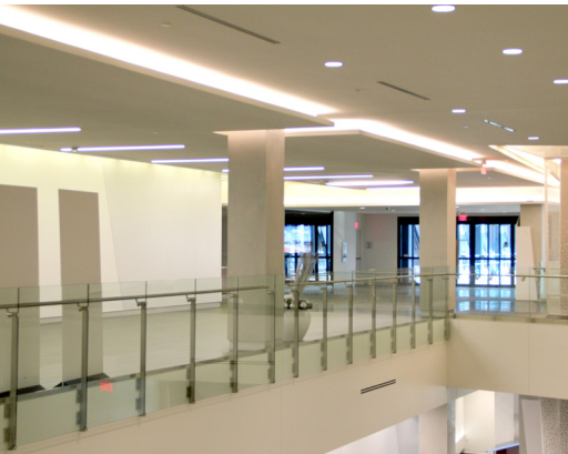
Railing posts were fascia-mounted, directly to the structural steel.

This project called for our Dot series railing system, a glass and stainless railing with trapezoidal post design. The Dot railing system provides a complimentary design aesthetic without detracting from visual interest of the varied use of materials in this 300K- square-foot renovation project, located in downtown Minneapolis.