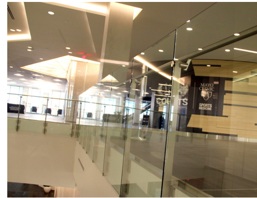
Custom mounting of glass on the drop side of the post accommodates glass overhang.