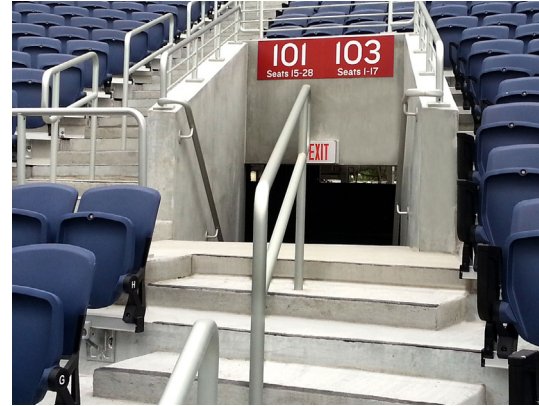
Aluminum multi-line at seating entrances.