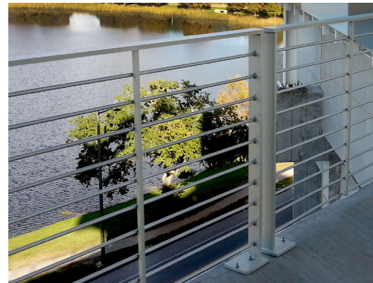
Aluminum multi-line balcony railing.

We elevate places where experiences happen by providing innovative engineering, fabrication, and installation solutions to the most complex challenges. Discover our unconventional approach.