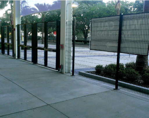
Exterior perimeter fencing and entrance gates.

With a construction period of just under 10 months, Sightline Commercial Solutions provided over 36,000 linear feet of ornamental railing including glass, aluminum picket railing, aluminum multi-line, drink rail, steel and stainless steel cable. Perimeter fencing was also provided surrounding the stadium.