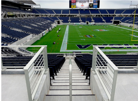
Stainless steel cable railing at ADA seating areas.