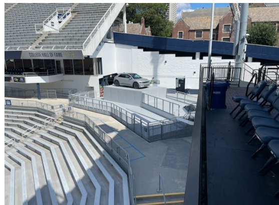
The Hyundai Nest can be spotted just off the field, an excellent advertising opportunity.