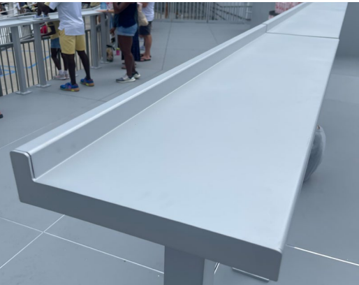
Sleek VIP Drink Rail enhance the safety of the VIP area.