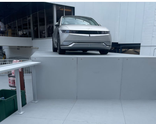
Clima-Core® all-weather platforms and versatile SC90® platforms create the pedestal stage.