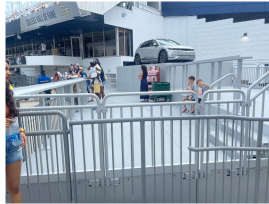
Guardrail provides safety to the viewing area.