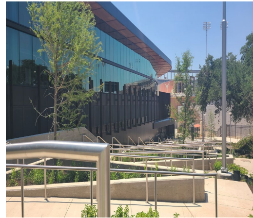
Handrails used around the arena.

We elevate places where experiences happen by providing innovative engineering, fabrication, and installation solutions to the most complex challenges. Discover our unconventional approach.