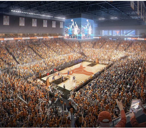
Fans gathered for the Final Four NCAA Tournament.

Scope: Nestled into a hillside on the University of Texas campus, the $375 million Moody Center is the most expensive college arena ever built and offers Austinites a state-of-the-art space to enjoy games and live events. Named in honor of the Moody Foundation, which has supported museums, libraries, universities and hospitals throughout Texas for more than 75 years, the multi-purpose facility features more than 6,000 linear feet of custom railing engineered by Sightline Commercial Solutions, a leading national provider of architectural railing systems for the commercial building arena. Designed primarily for concerts, the multi-purpose arena features the nation's largest event floor along with top-tier amenities and hospitality for artists, athletes and fans, including 44 porch suites and nearly 2,000 club seats, three premium clubs, 57 loge boxes and one super VIP club.