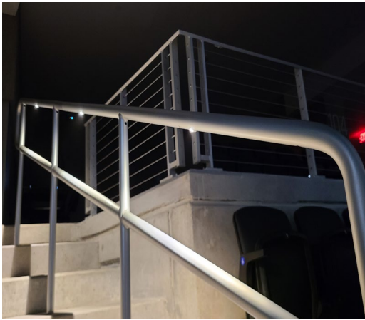
Modern LED handrails were used on the exterior for ample safety.