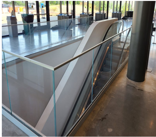
Stainless steel handrails installed around escalators.