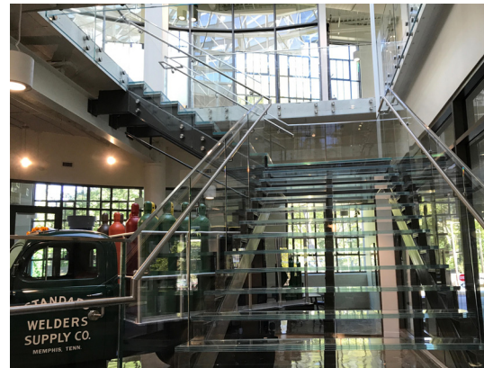
The client wanted the illusion of invisible treads, this was achieved with Point Series and glass treads.

We elevate places where experiences happen by providing innovative engineering, fabrication, and installation solutions to the most complex challenges. Discover our unconventional approach.