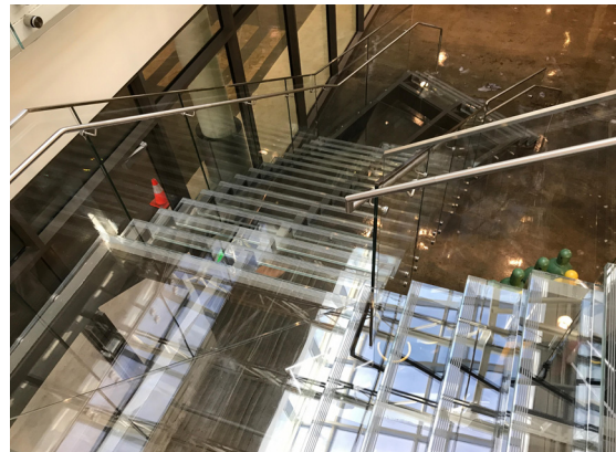
Glass treads and risers, combined with Point Series railing system, give this staircase a seamless, barely there appearance.