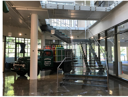
Tread comprised of low-iron glass with an anti-slip sandblast etch adds functionality while maintaining the design intent.