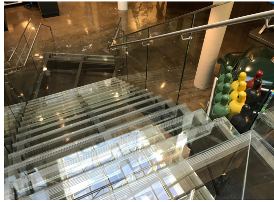
Glass treads and risers were attached using three-inch-wide, clear VHB tape, adding to the illusion of invisibility.