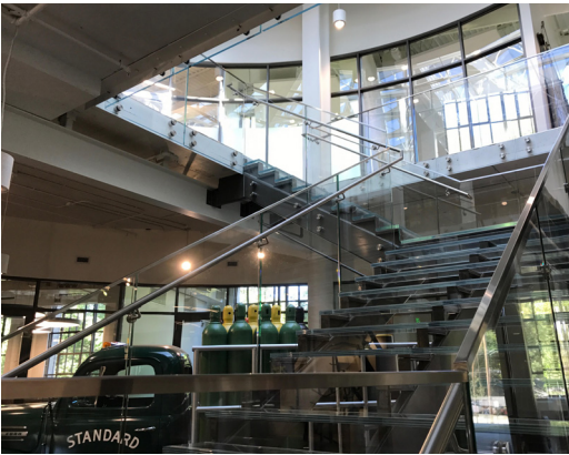
The overlook glass was attached with a through bolt on the lower nodes and an epoxy anchor for the top.

When nexAir, one of the largest distributors of atmospheric gases and welding supplies in the country, moved its corporate headquarters to a new location in Memphis, Tennessee, the company wanted an office space to match its industry-leading reputation. Sightline Commercial Solutions worked with Tull Brothers, Grinder, Taber, & Grinder, Inc., and LRK, Inc. to provide the nexAir headquarters lobby with a glass staircase that looks as light as air. The result is a polished and modern lobby that sets the tone for the building's aesthetic appeal.