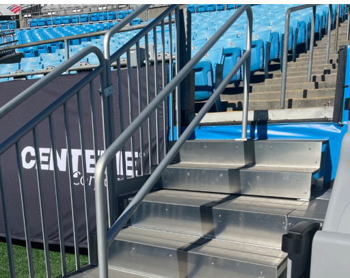
Convenient portable stair units provide quick and safe access