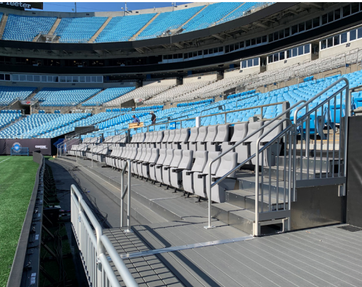
Sightline Commercial Solutions VIP Seating provides an upgraded fan experience