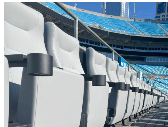
Luxurious comfort provide fans with the best seats in the house

We elevate places where experiences happen by providing innovative engineering, fabrication, and installation solutions to the most complex challenges. Discover our unconventional approach.