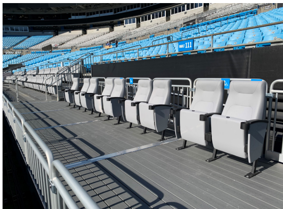
Platforms with composite decking provides longevity with aesthetic