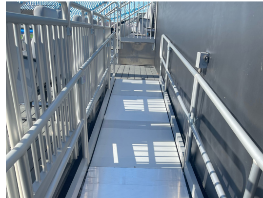
Portable ramps provide ADA compliant access for patrons