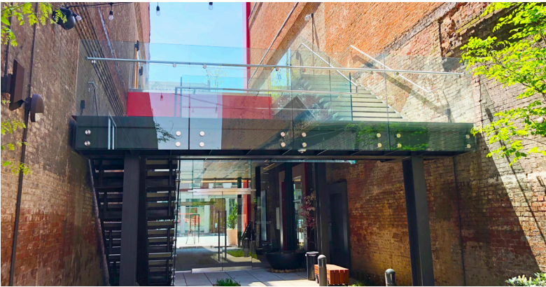
Point railing is used on both sides of the bridge to provide a safe and stylish walkway to the exterior courtyard.

Scope: Since 2004, the Frazier History Museum in Louisville has educated patrons about world, U.S. and Kentucky history through its three floors of exhibits featuring artifacts from around the globe, including one of the largest collections of toy soldiers and historical miniatures, Teddy Roosevelt's "Big Stick," Geronimo's bow and arrows, and a first edition copy of Uncle Tom's Cabin. As the official starting point of the Kentucky Bourbon Trail®, the museum houses the Kentucky Bourbon Trail® Welcome Center, offering a professional concierge service to help visitors plan their statewide distillery tours. Surrounding the museum building are more than 140 linear feet of Sightline Commercial Solutions' railing. Point Rail and Track Rail with clear glass panels line the courtyard staircase and exterior roof garden, delivering a modern aesthetic and unobstructed views. Not included in the original design plans, LED handrails were custom-designed and incorporated midway through the project to illuminate the complex glass staircase system to enhance safety and ambience.