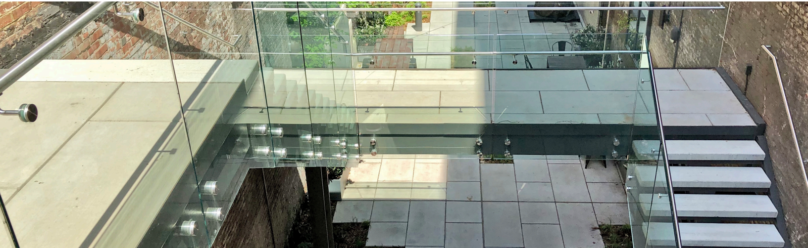
Point railing with 13/16" clear, tempered laminated glass with SGP interlayer and polished exposed edges is used on the stairs, bridge and overlooks, allowing for unobstructed views of the courtyard.

We elevate places where experiences happen by providing innovative engineering, fabrication, and installation solutions to the most complex challenges. Discover our unconventional approach.