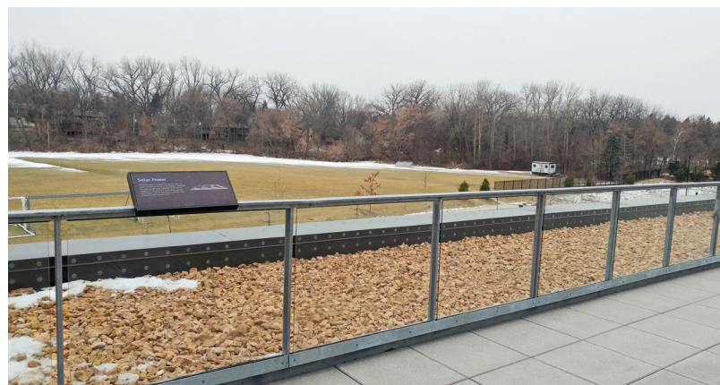
On the second level terrace, Post Rail made of galvanized steel features 3/8" laminated tempered clear glass infill, providing sweeping views of the surrounding landscape.

We elevate places where experiences happen by providing innovative engineering, fabrication, and installation solutions to the most complex challenges. Discover our unconventional approach.