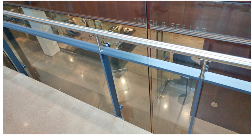
Floor mounted Post Rail with stainless steel bar posts and rail frames are used on the staircase and overlooks.