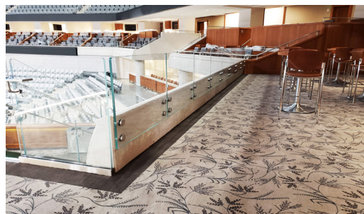
3/4 tempered/laminated SGP interlayer glass lines add style and luxury to the space.