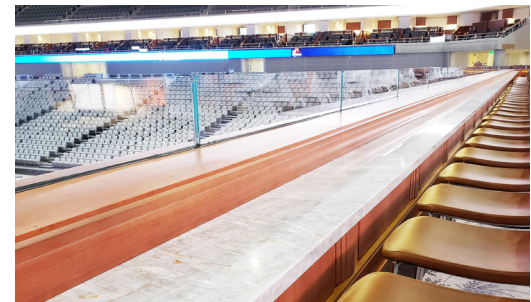
Glass was used as front-of-seat railing to create an open feel and clear views.