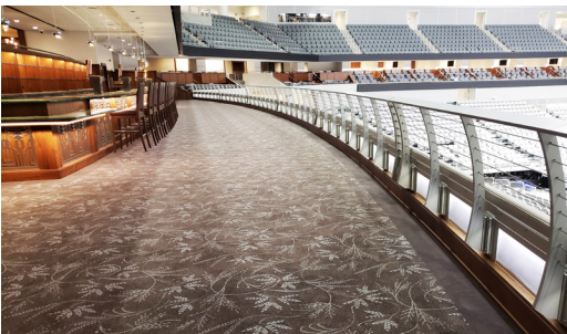
Curved posts guardrail at the North Club offers unobstructed views.

Scope: Dickies Arena is Fort Worth's new crown jewel and go-to destination for sports, concerts and major events, such as the annual Stock & Rodeo Show. The design of Dickies Arena draws inspiration from the classic architecture of Texas and combines it with modern amenities. At 750,000 square feet, the multipurpose venue features 14,000 linear feet of custom architectural railing from Sightline Commercial Solutions. Railing types include picket, cable, guardrail, LED handrail and glass railing, designed to enhance the accessibility, safety and overall fan experience inside and outside the arena. The railings complement the building's stunning art deco architecture, most prominent on the stairs, balconies and pedestrian bridge. Iconic prairie motifs are incorporated in the metalwork and railings, as well.