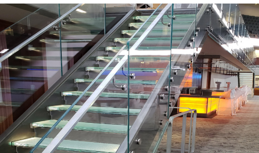
Point™ series glass railing providing a nearly invisible look at the North Club stair.