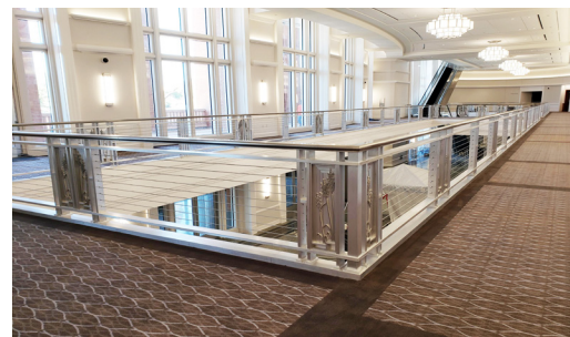
Cable rail provides a decorative appearance and accompanies the arena's concourse.