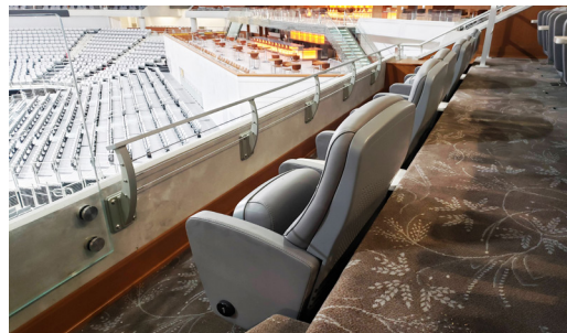
Minimal sightline obstruction with Tensiline™ railing in front of fan seating.