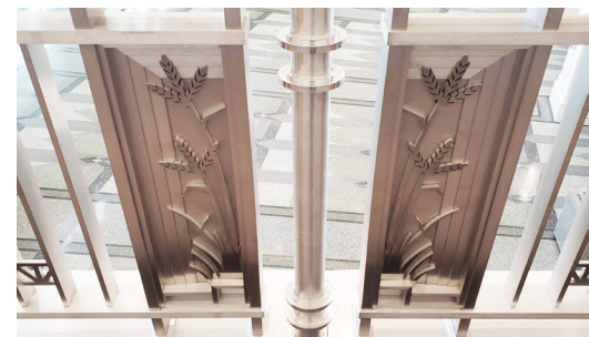
The Lone Star State's native prairie grass is incorporated into the custom balcony rail.