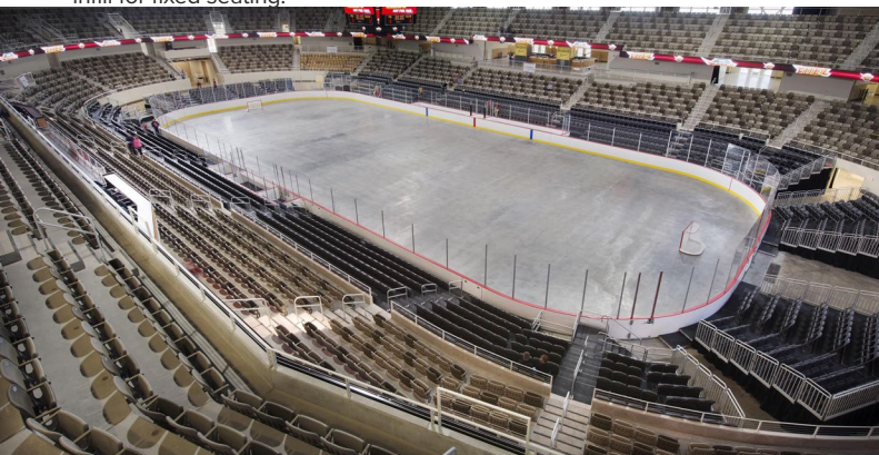
The Coliseum can quickly and easily transform into a hockey arena, rodeo arena, concert venue or a stadium for other events.