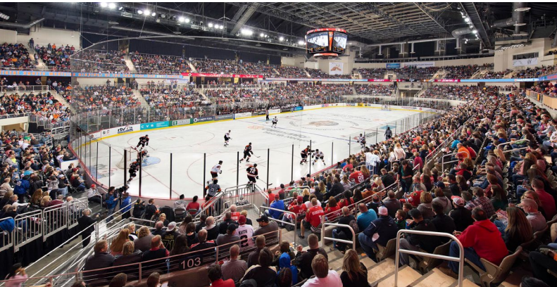
The project included more than 500 custom platforms, numerous ADA accessible viewing platforms, and a massive removable seven-tier vomitory infill for fixed seating.

In February of 2014, after months of designing and planning, Sightline Commercial Solutions completed installation on one of its largest staging orders to date: The Indiana Farmers Coliseum in Indianapolis, Indiana (formerly named "Pepsi Coliseum"). The project included more than 500 custom platforms, numerous ADA accessible viewing platforms, and a massive removable seven-tier vomitory infill for fixed seating. The Coliseum presented many new and exciting challenges for Sightline Commercial Solutions due to of the venue's tight tolerances and additional ongoing renovations, which were completed just weeks before the installation date. Sightline Commercial Solutions' product was designed to fit between a newly constructed dasher board system for the ice rink setup and concrete stadia that had existing fixed seating. The goal was to incorporate products that would allow the Coliseum to be quickly and easily transformed into a hockey arena, rodeo arena, concert venue or a stadium for other events. With the help of Sightline Commercial Solutions' design team, in-house fabrication, and installation experience, the Farmers Coliseum project was not only fabricated in less than six weeks, but was also installed ahead of schedule.