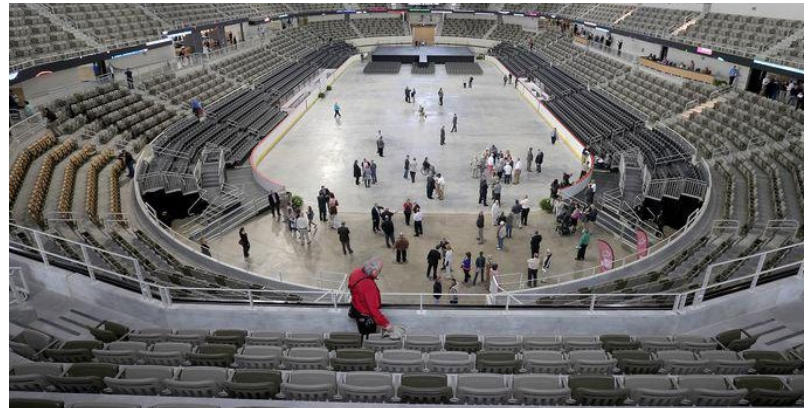
With the help of Sightline's design team, in-house fabrication, and installation experience, the Farmers Coliseum project was not only fabricated in less than six weeks, but was also installed ahead of schedule.