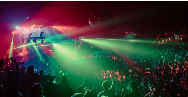
The 40' x 60' stage can be made smaller to accommodate different event sizes, providing the feel of full venue no matter the occupancy.

Scope: Inspired by the iconic natural amphitheater Red Rocks, Mission Ballroom is a state-of-the-art music venue in Denver's chic, industrial River North neighborhood that draws a mix of hip hop, indie and mainstream bands to the Mile High City. Sightline Commercial Solutions contributed to the construction of the dedicated music space by building a 40' x 60' SC2003 rolling stage, which offers the ultimate in flexibility and convenient transport. It's a sleek, efficient solution that allows the venue to cater the space to the size of the crowd; because the audience can't see behind the stage, it provides the feel of a venue with full occupancy, no matter the audience size. Sightline Commercial Solutions also provided drum risers and custom speaker shelves, which hang off the front of the stage for optimal sound to resonate within the venue. After the venue opened to rave reviews, Sightline's enlarged the stage to 60' x 60' overall by adding another 20' x 60' non-rolling thrust.