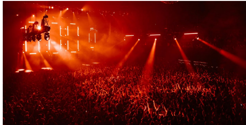
A rolling stage offers flexibility and convenient transport for Mission Ballroom.