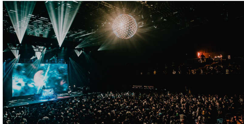
Drum risers are used throughout Mission Ballroom and the custom speaker shelves hang off the front of the stage for optimal sound to resonate within the venue.

We elevate places where experiences happen by providing innovative engineering, fabrication, and installation solutions to the most complex challenges. Discover our unconventional approach.